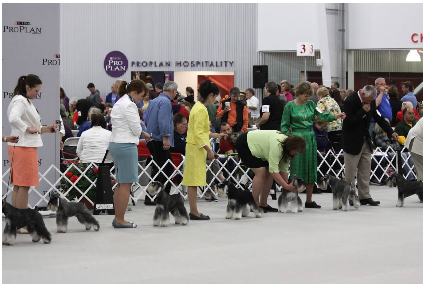
Bred-by Exhibitor bitch class, lined up for judging.

The day of the Nationals was capped by first ever “Best Schnauzer” Competitions adjudicated by Bruce Schwartz.