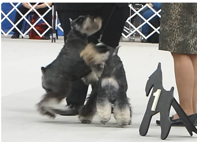
Am.GCh.Can.Ch.Minuteman Underworld and Minuteman Toxicology, acting up in Best in Brace.